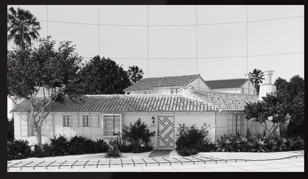
scene 02 wire