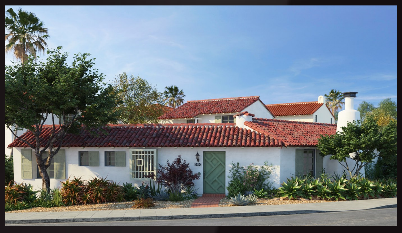
scene 02 render

Have you ever wanted to make professional exterior renderings? Do you know how to use VRaySun, VRaySky and VRayPhisicalCamera? Have you ever had problems with composition? Archexteriors will end all your problems. Take a look at this 10 fully textured scenes with professional shaders and lighting ready to render. Get your own portfolio and join cg market.