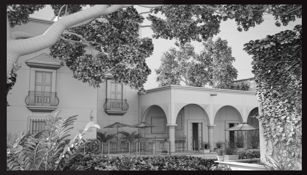
scene 05 wire