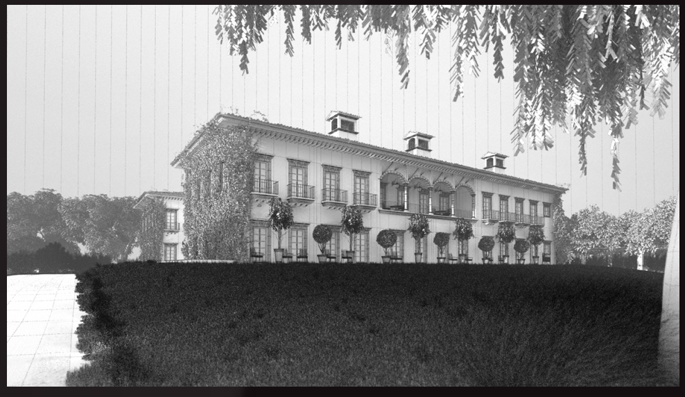
scene 09 wire