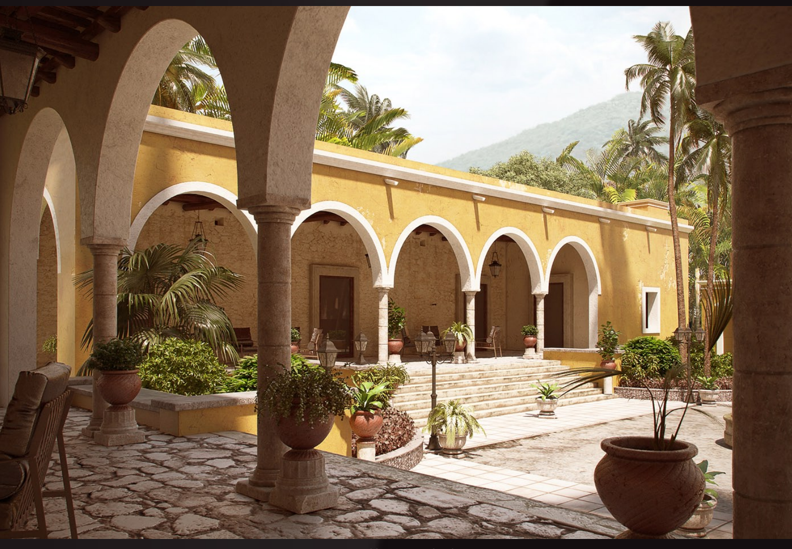
scene 10 post-production

Have you ever wanted to make professional exterior renderings? Do you know how to use VRaySun, VRaySky and VRayPhisicalCamera? Have you ever had problems with composition? Archexteriors will end all your problems. Take a look at this 10 fully textured scenes with professional shaders and lighting ready to render. Get your own portfolio and join cg market.