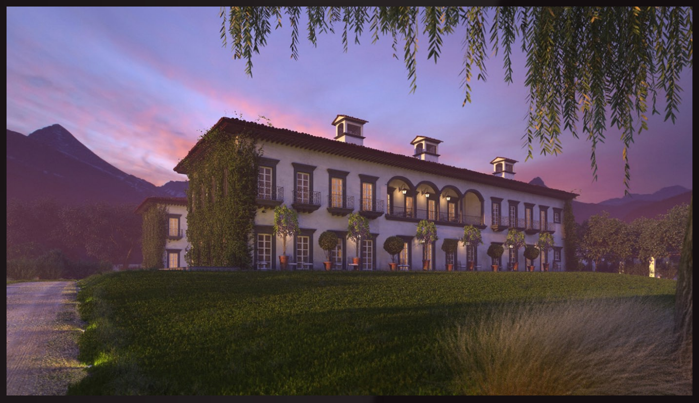
scene 09 render

Have you ever wanted to make professional exterior renderings? Do you know how to use VRaySun, VRaySky and VRayPhisicalCamera? Have you ever had problems with composition? Archexteriors will end all your problems. Take a look at this 10 fully textured scenes with professional shaders and lighting ready to render. Get your own portfolio and join cg market.