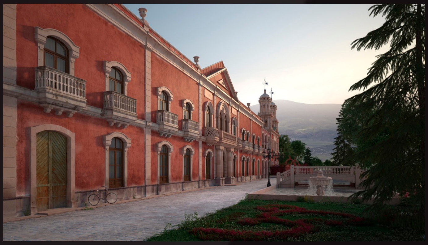
scene 06 render

Have you ever wanted to make professional exterior renderings? Do you know how to use VRaySun, VRaySky and VRayPhisicalCamera? Have you ever had problems with composition? Archexteriors will end all your problems. Take a look at this 10 fully textured scenes with professional shaders and lighting ready to render. Get your own portfolio and join cg market.