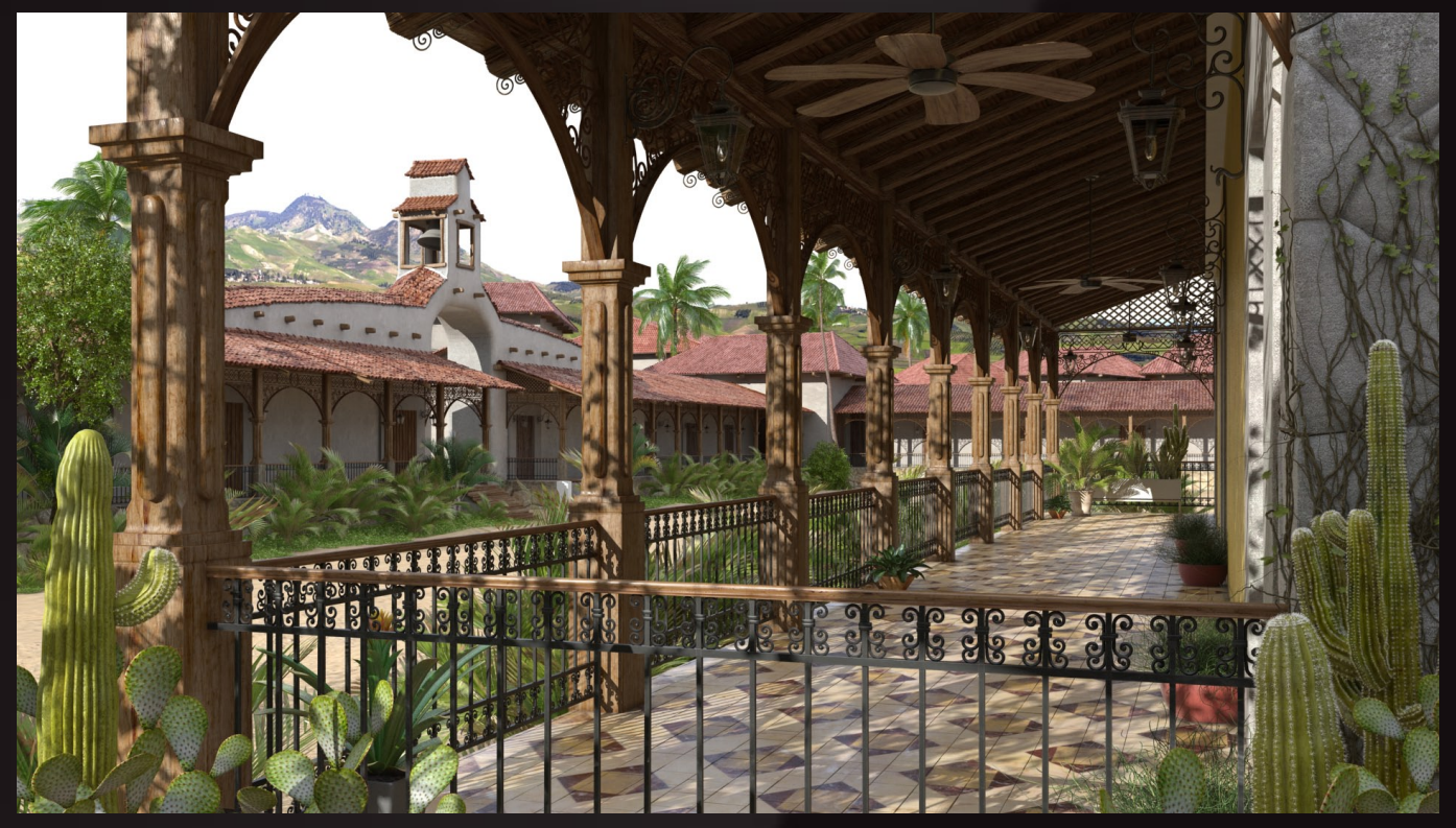
scene 04 render

Have you ever wanted to make professional exterior renderings? Do you know how to use VRaySun, VRaySky and VRayPhisicalCamera? Have you ever had problems with composition? Archexteriors will end all your problems. Take a look at this 10 fully textured scenes with professional shaders and lighting ready to render. Get your own portfolio and join cg market.