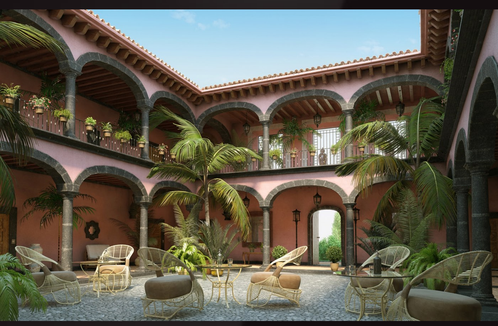
scene 03 post-production

Have you ever wanted to make professional exterior renderings? Do you know how to use VRaySun, VRaySky and VRayPhisicalCamera? Have you ever had problems with composition? Archexteriors will end all your problems. Take a look at this 10 fully textured scenes with professional shaders and lighting ready to render. Get your own portfolio and join cg market.