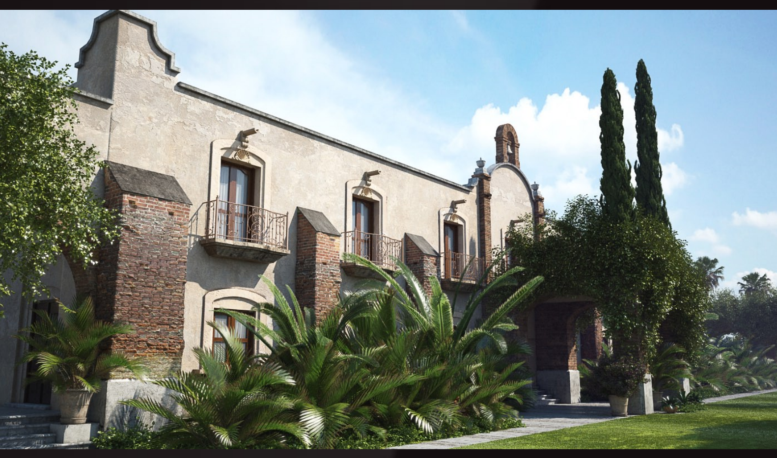
scene 07 post-production

Have you ever wanted to make professional exterior renderings? Do you know how to use VRaySun, VRaySky and VRayPhisicalCamera? Have you ever had problems with composition? Archexteriors will end all your problems. Take a look at this 10 fully textured scenes with professional shaders and lighting ready to render. Get your own portfolio and join cg market.