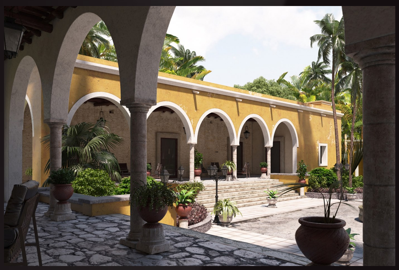
scene 10 render

Have you ever wanted to make professional exterior renderings? Do you know how to use VRaySun, VRaySky and VRayPhisicalCamera? Have you ever had problems with composition? Archexteriors will end all your problems. Take a look at this 10 fully textured scenes with professional shaders and lighting ready to render. Get your own portfolio and join cg market.