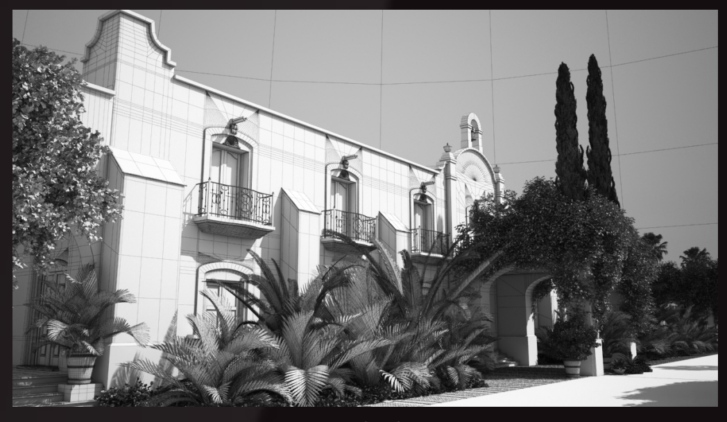
scene 07 wire