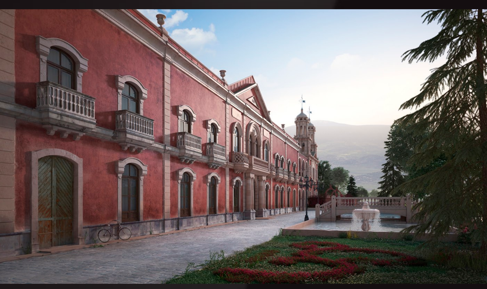
scene 06 post-production

Have you ever wanted to make professional exterior renderings? Do you know how to use VRaySun, VRaySky and VRayPhisicalCamera? Have you ever had problems with composition? Archexteriors will end all your problems. Take a look at this 10 fully textured scenes with professional shaders and lighting ready to render. Get your own portfolio and join cg market.