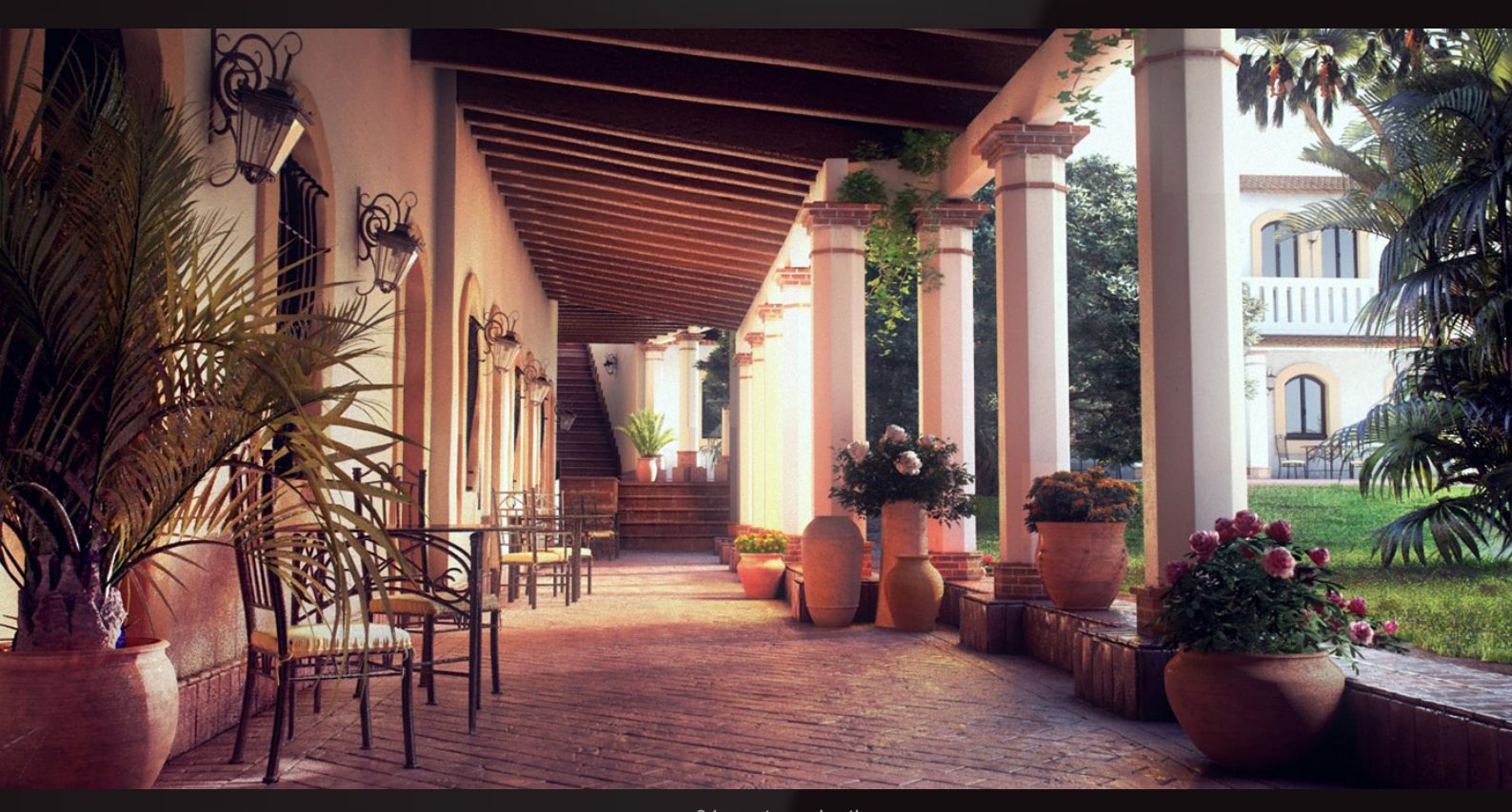
scene 01 post-production

Have you ever wanted to make professional exterior renderings? Do you know how to use VRaySun, VRaySky and VRayPhisicalCamera? Have you ever had problems with composition? Archexteriors will end all your problems. Take a look at this 10 fully textured scenes with professional shaders and lighting ready to render. Get your own portfolio and join cg market.