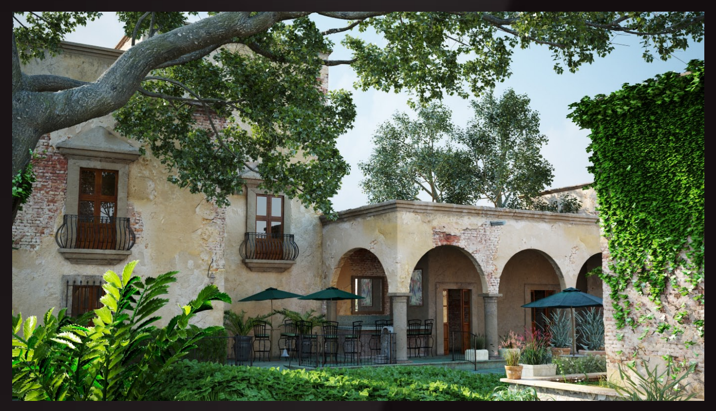
scene 05 render

Have you ever wanted to make professional exterior renderings? Do you know how to use VRaySun, VRaySky and VRayPhisicalCamera? Have you ever had problems with composition? Archexteriors will end all your problems. Take a look at this 10 fully textured scenes with professional shaders and lighting ready to render. Get your own portfolio and join cg market.