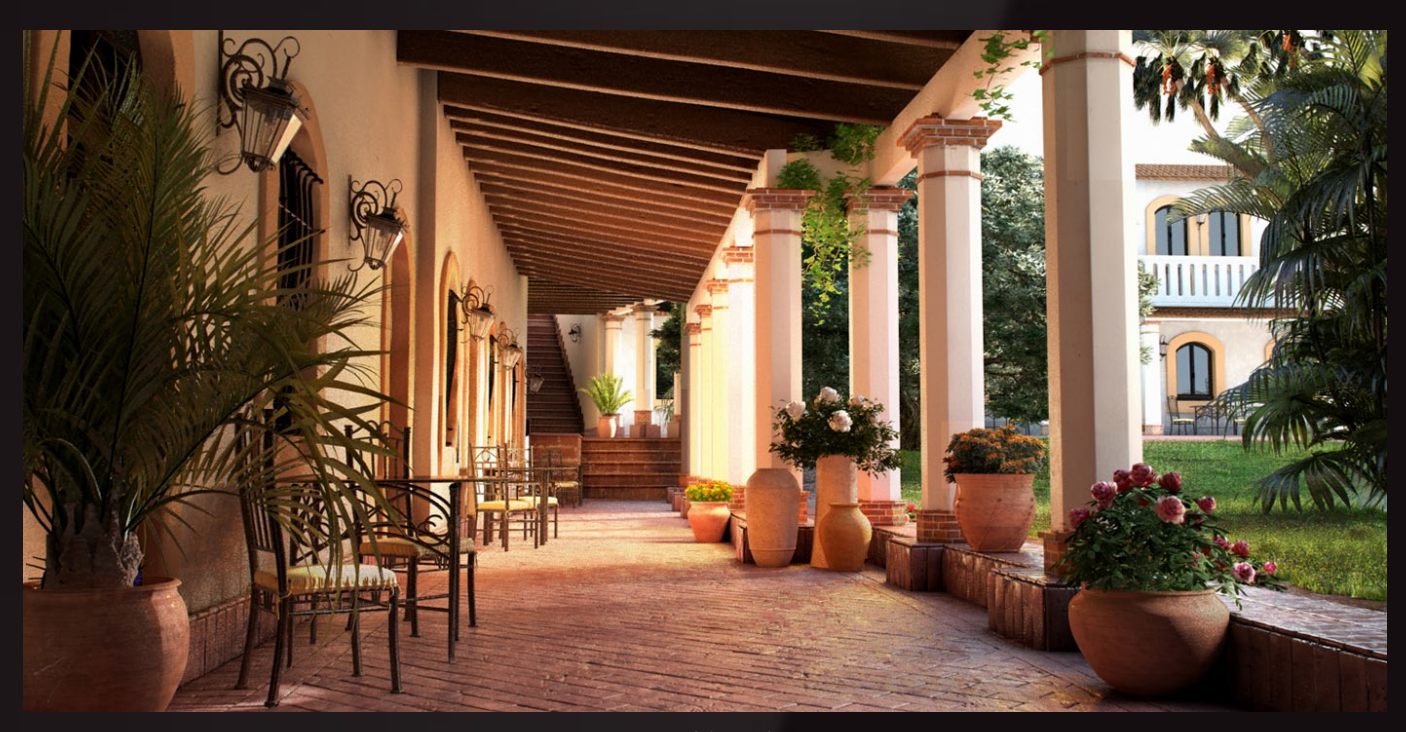
scene 01 render

Have you ever wanted to make professional exterior renderings? Do you know how to use VRaySun, VRaySky and VRayPhisicalCamera? Have you ever had problems with composition? Archexteriors will end all your problems. Take a look at this 10 fully textured scenes with professional shaders and lighting ready to render. Get your own portfolio and join cg market.