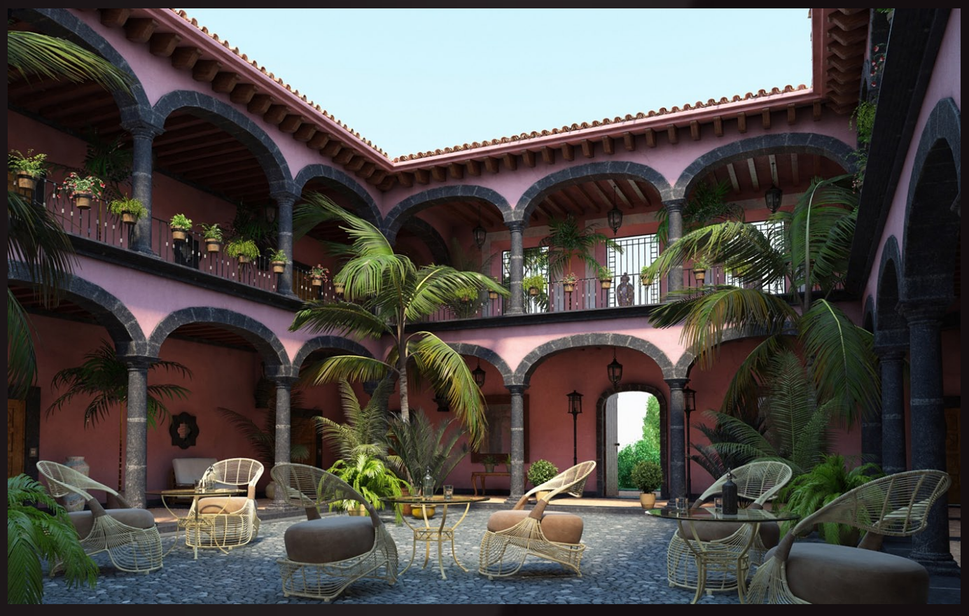
scene 03 render

Have you ever wanted to make professional exterior renderings? Do you know how to use VRaySun, VRaySky and VRayPhisicalCamera? Have you ever had problems with composition? Archexteriors will end all your problems. Take a look at this 10 fully textured scenes with professional shaders and lighting ready to render. Get your own portfolio and join cg market.