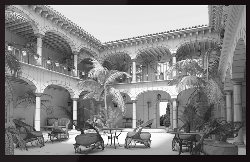
scene 03 wire