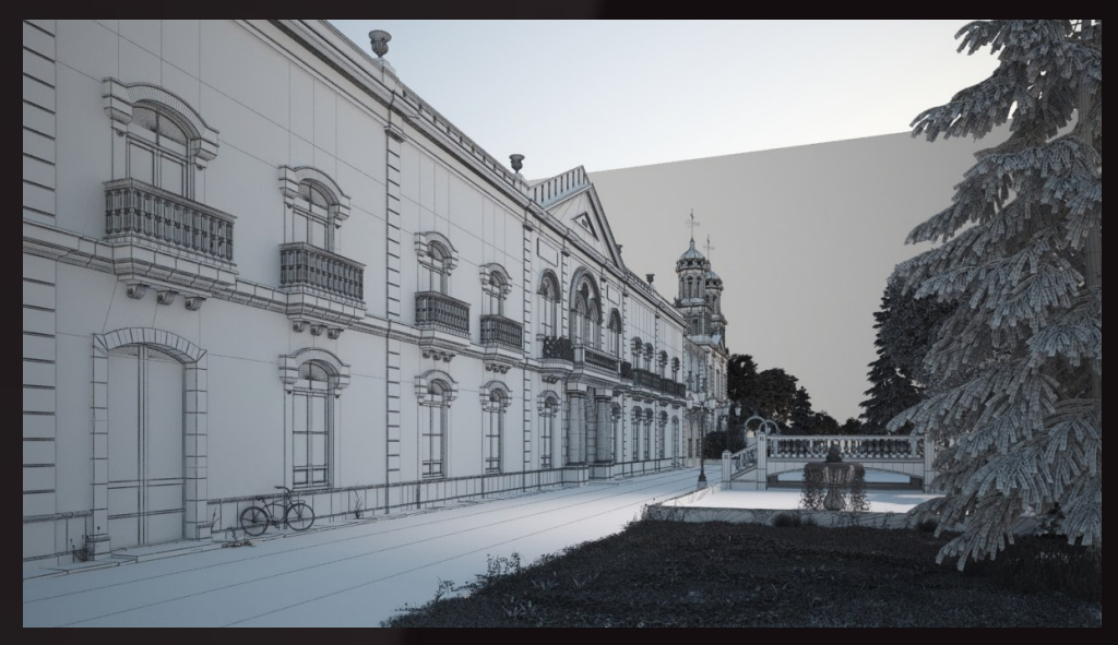
scene 06 wire