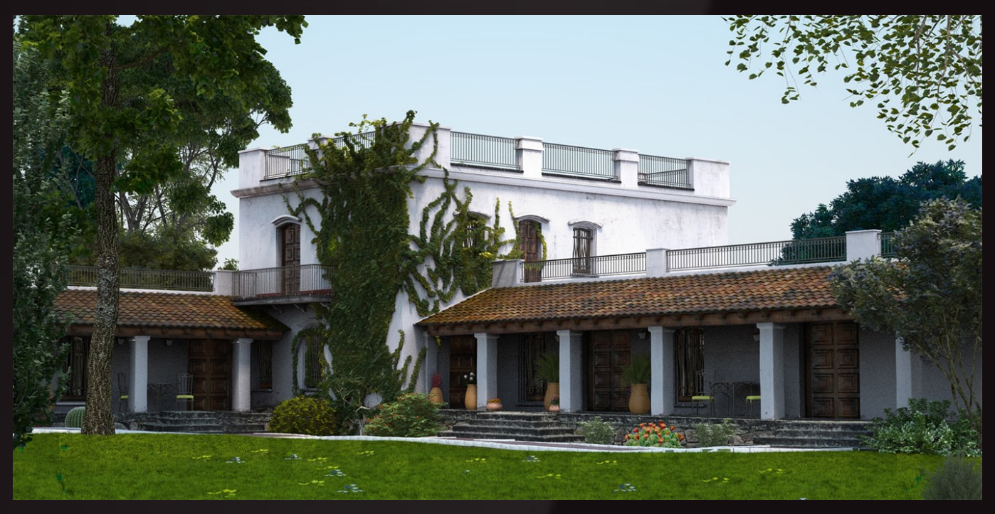
scene 08 render

Have you ever wanted to make professional exterior renderings? Do you know how to use VRaySun, VRaySky and VRayPhisicalCamera? Have you ever had problems with composition? Archexteriors will end all your problems. Take a look at this 10 fully textured scenes with professional shaders and lighting ready to render. Get your own portfolio and join cg market.