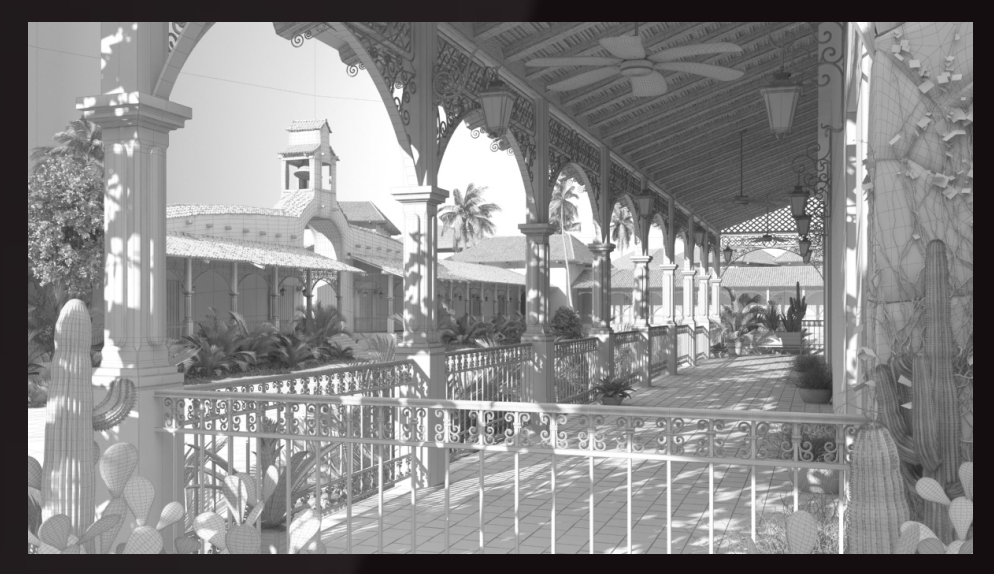
scene 04 wire