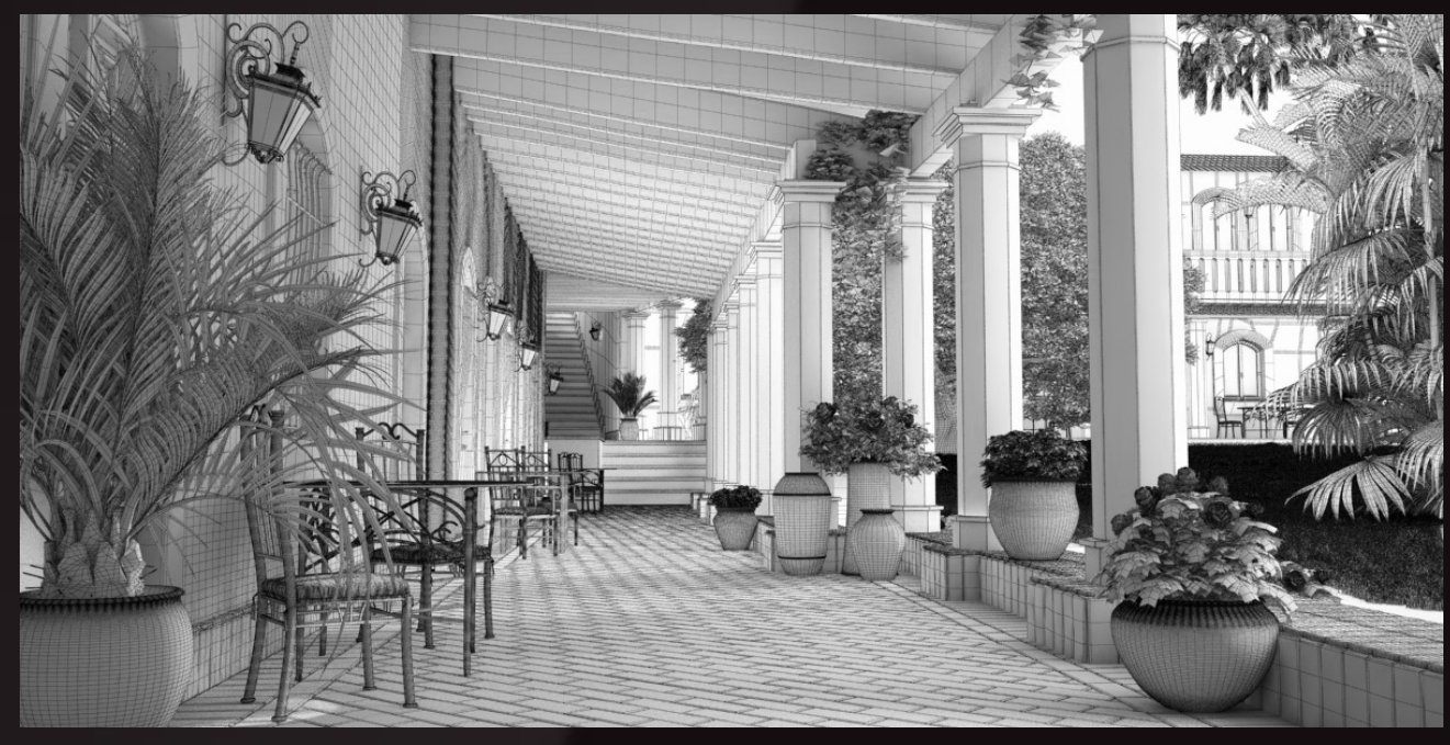
scene 01 wire