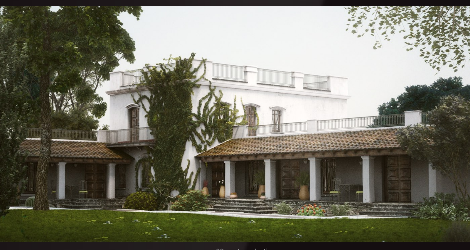
scene 08 post-production

Have you ever wanted to make professional exterior renderings? Do you know how to use VRaySun, VRaySky and VRayPhisicalCamera? Have you ever had problems with composition? Archexteriors will end all your problems. Take a look at this 10 fully textured scenes with professional shaders and lighting ready to render. Get your own portfolio and join cg market.