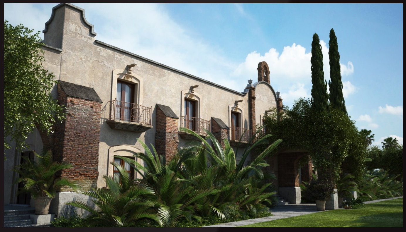
scene 07 render

Have you ever wanted to make professional exterior renderings? Do you know how to use VRaySun, VRaySky and VRayPhisicalCamera? Have you ever had problems with composition? Archexteriors will end all your problems. Take a look at this 10 fully textured scenes with professional shaders and lighting ready to render. Get your own portfolio and join cg market.