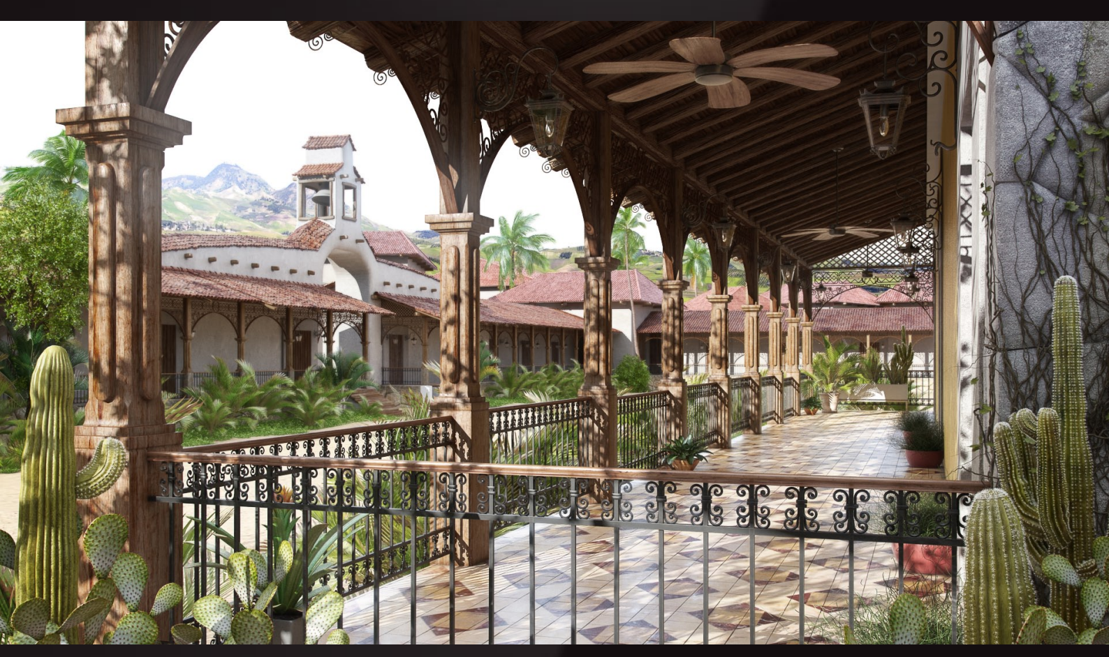
scene 04 post-production

Have you ever wanted to make professional exterior renderings? Do you know how to use VRaySun, VRaySky and VRayPhisicalCamera? Have you ever had problems with composition? Archexteriors will end all your problems. Take a look at this 10 fully textured scenes with professional shaders and lighting ready to render. Get your own portfolio and join cg market.