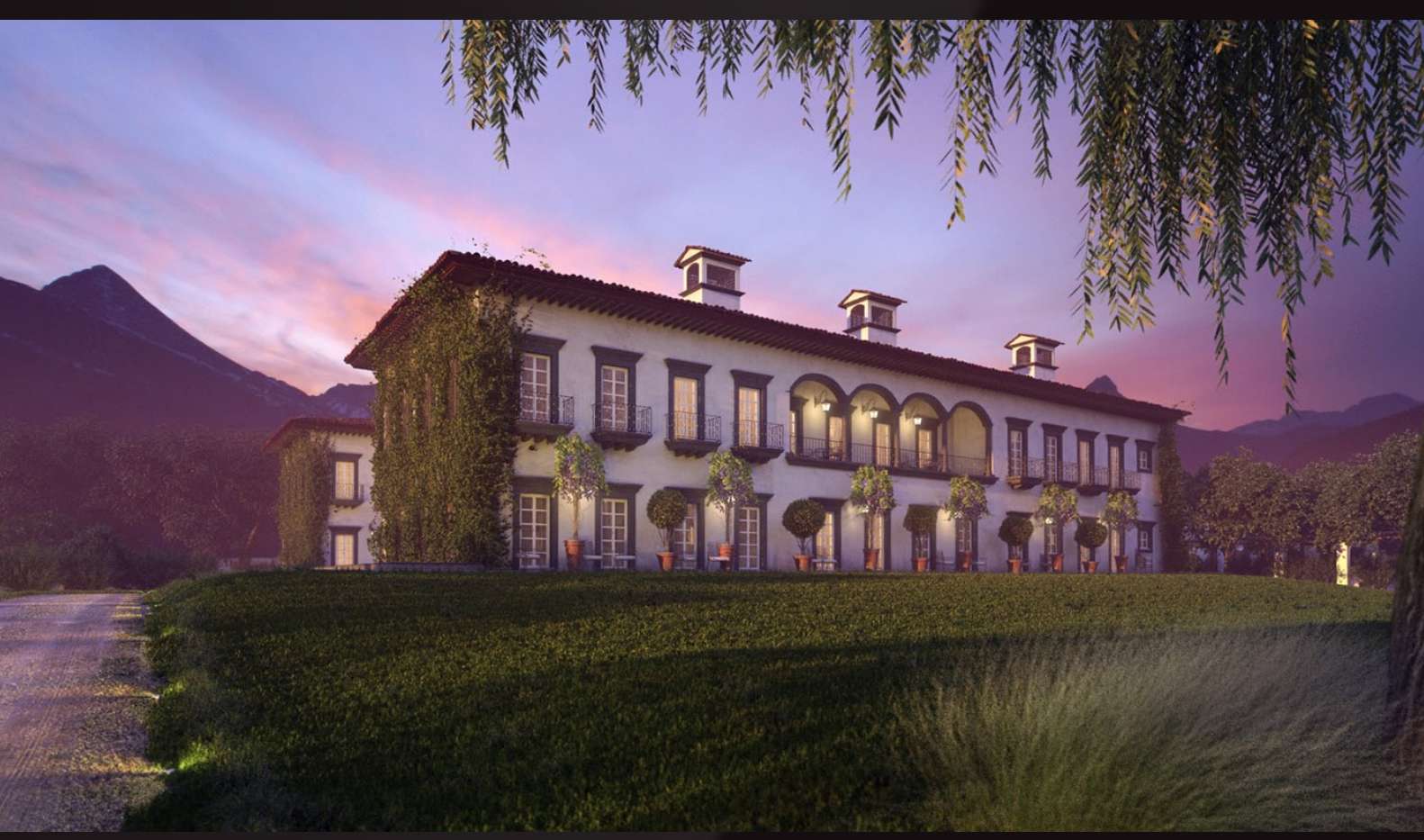
scene 09 post-production

Have you ever wanted to make professional exterior renderings? Do you know how to use VRaySun, VRaySky and VRayPhisicalCamera? Have you ever had problems with composition? Archexteriors will end all your problems. Take a look at this 10 fully textured scenes with professional shaders and lighting ready to render. Get your own portfolio and join cg market.