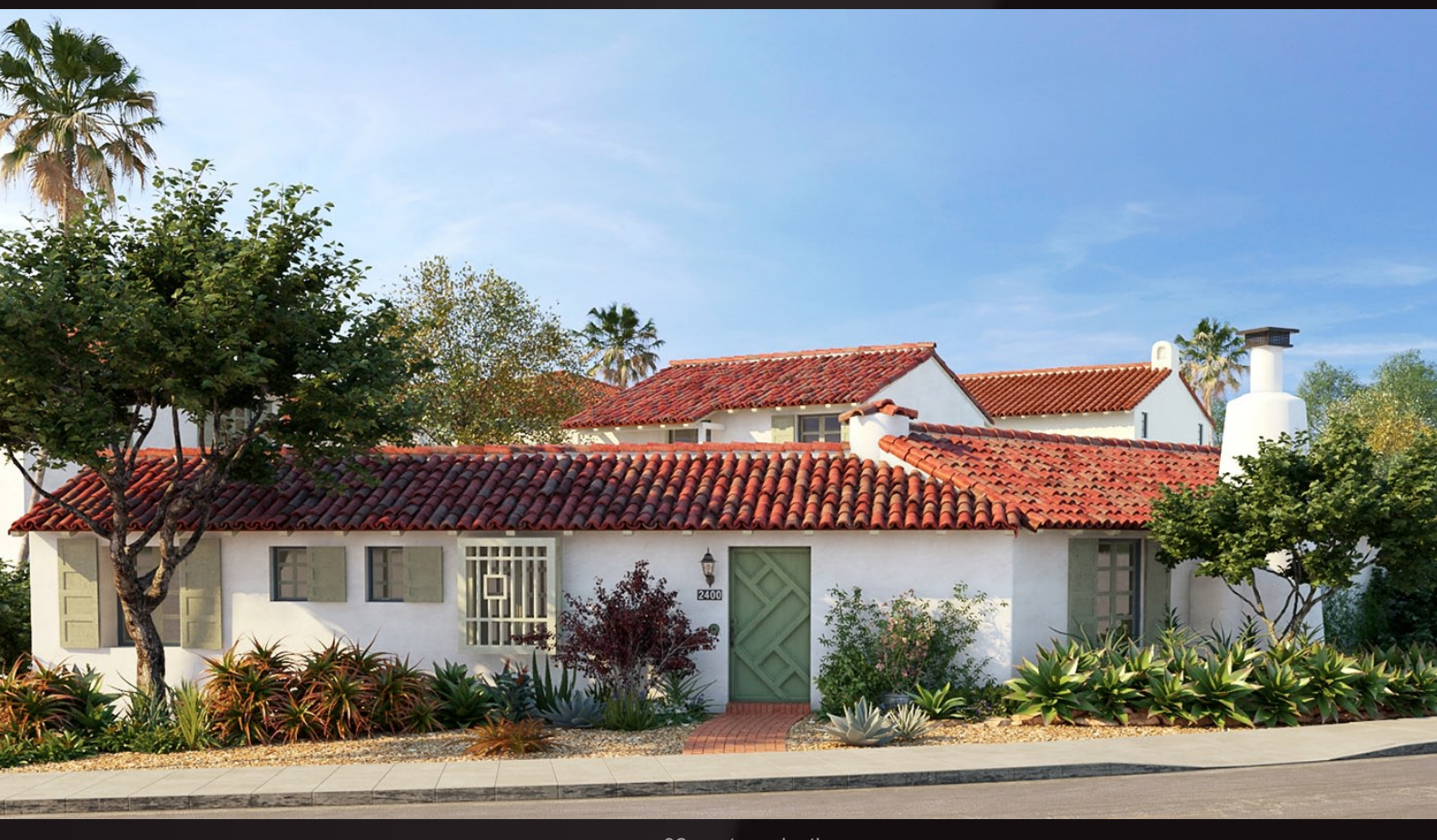
scene 02 post-production

Have you ever wanted to make professional exterior renderings? Do you know how to use VRaySun, VRaySky and VRayPhisicalCamera? Have you ever had problems with composition? Archexteriors will end all your problems. Take a look at this 10 fully textured scenes with professional shaders and lighting ready to render. Get your own portfolio and join cg market.