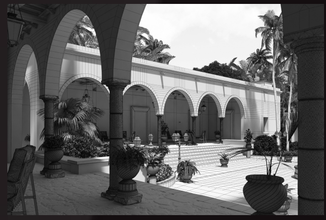
scene 10 wire