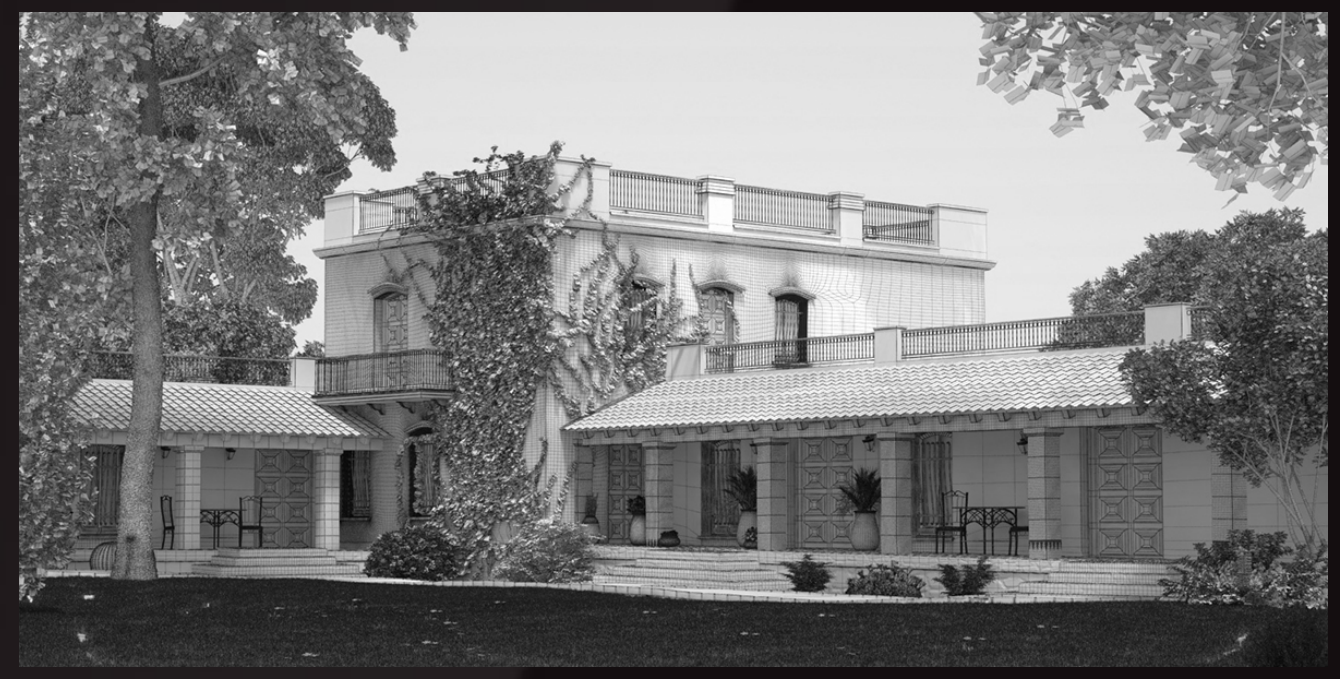
scene 08 wire