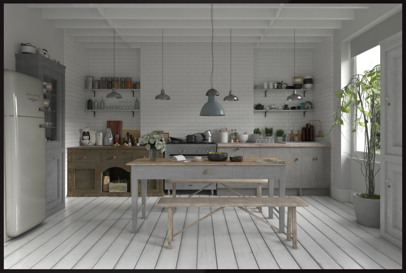
scene 03 raw

Have you ever wanted to make professional interior renderings? Do you know how to use VRaySun, VRaySky and VRayPhisicalCamera? Have you ever had problems with composition? Archinteriors will end all your problems. Take a look at this 10 fully textured scenes with professional shaders and lighting ready to render. Get your own portfolio and join cg market.