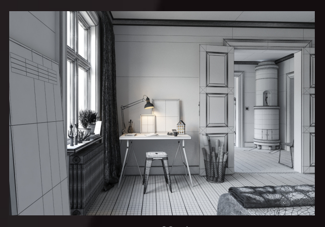
scene 06 wire