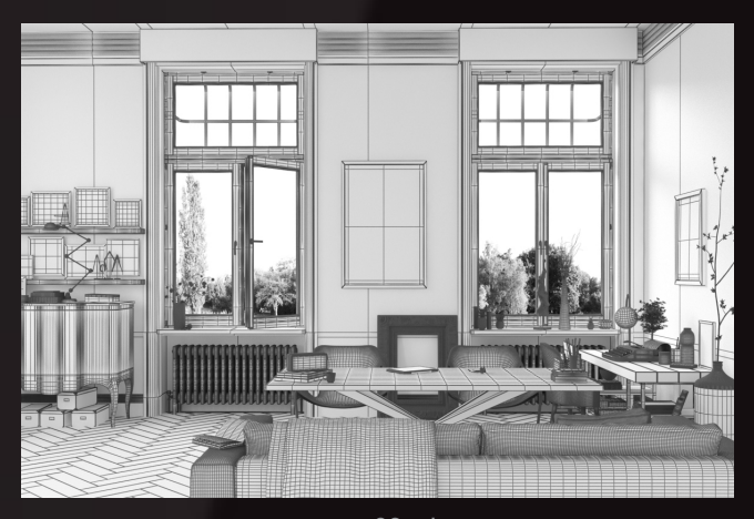
scene 09 wire