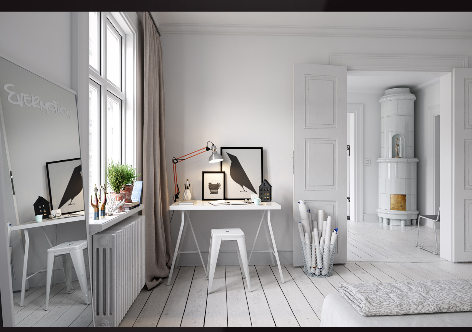
scene 06 post production

Have you ever wanted to make professional interior renderings? Do you know how to use VRaySun, VRaySky and VRayPhisicalCamera? Have you ever had problems with composition? Archinteriors will end all your problems. Take a look at this 10 fully textured scenes with professional shaders and lighting ready to render. Get your own portfolio and join cg market.