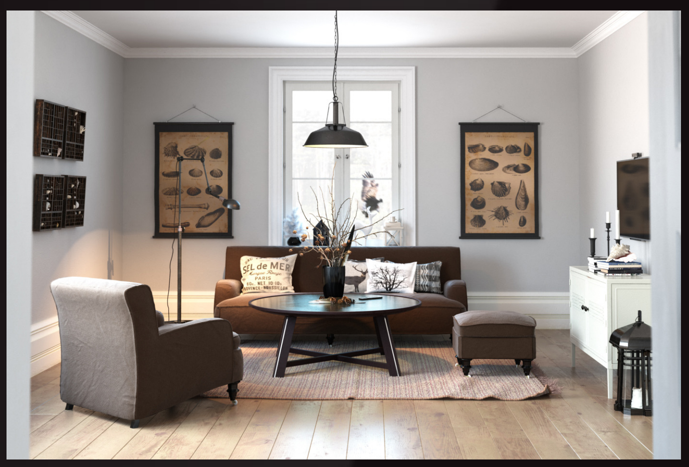
scene 08 raw

Have you ever wanted to make professional interior renderings? Do you know how to use VRaySun, VRaySky and VRayPhisicalCamera? Have you ever had problems with composition? Archinteriors will end all your problems. Take a look at this 10 fully textured scenes with professional shaders and lighting ready to render. Get your own portfolio and join cg market.