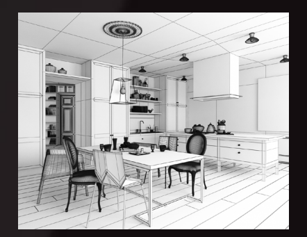
scene 07 wire