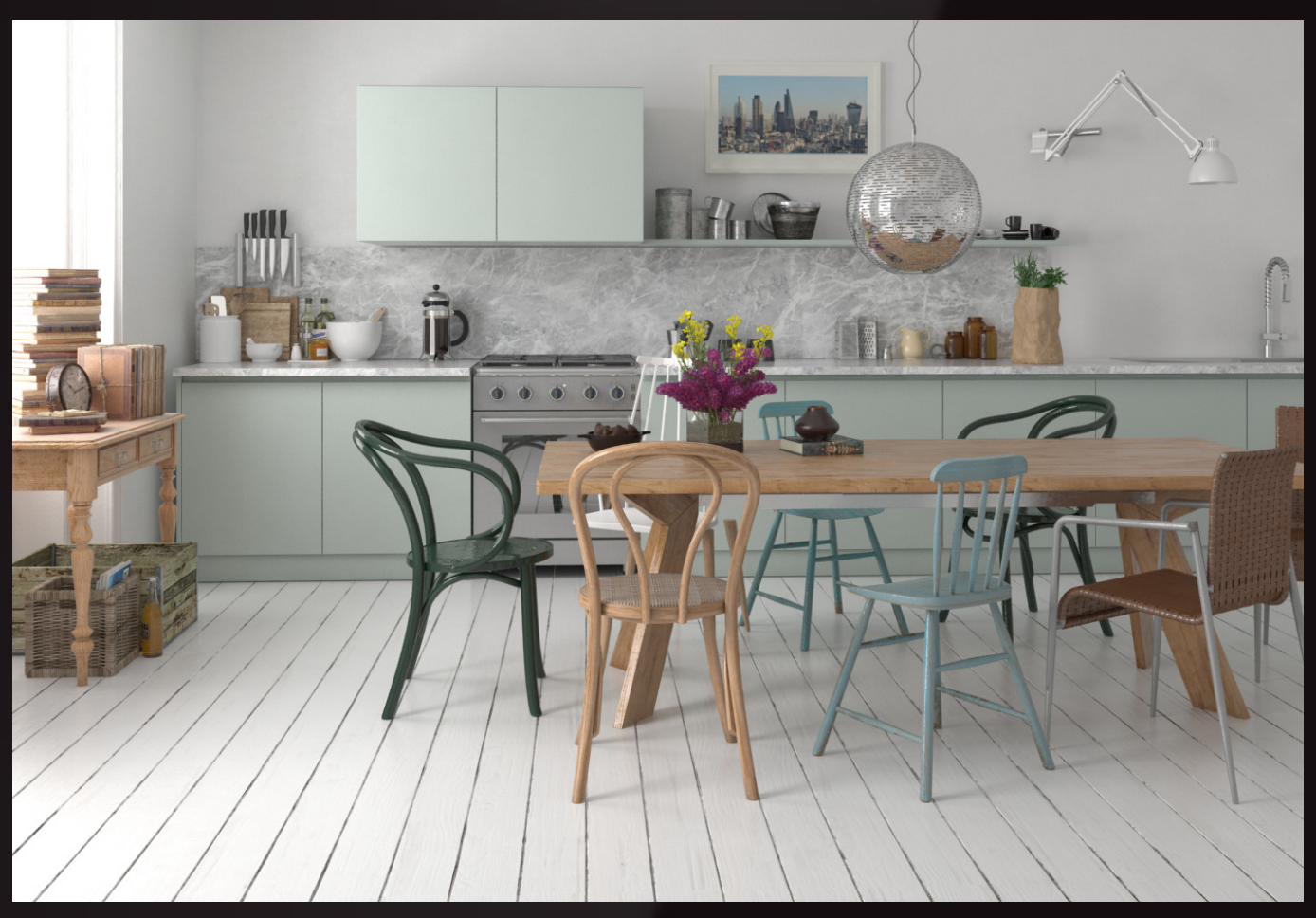
scene 01 raw

Have you ever wanted to make professional interior renderings? Do you know how to use VRaySun, VRaySky and VRayPhisicalCamera? Have you ever had problems with composition? Archinteriors will end all your problems. Take a look at this 10 fully textured scenes with professional shaders and lighting ready to render. Get your own portfolio and join cg market.