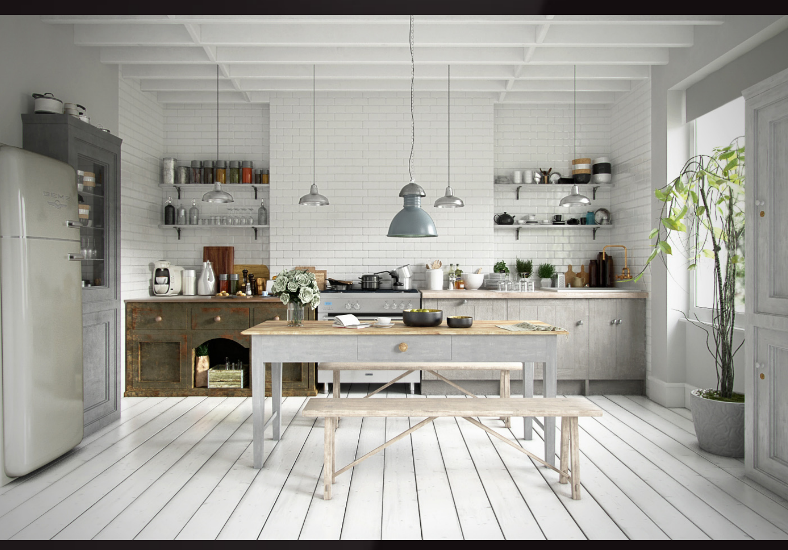
scene 03 post production

Have you ever wanted to make professional interior renderings? Do you know how to use VRaySun, VRaySky and VRayPhisicalCamera? Have you ever had problems with composition? Archinteriors will end all your problems. Take a look at this 10 fully textured scenes with professional shaders and lighting ready to render. Get your own portfolio and join cg market.