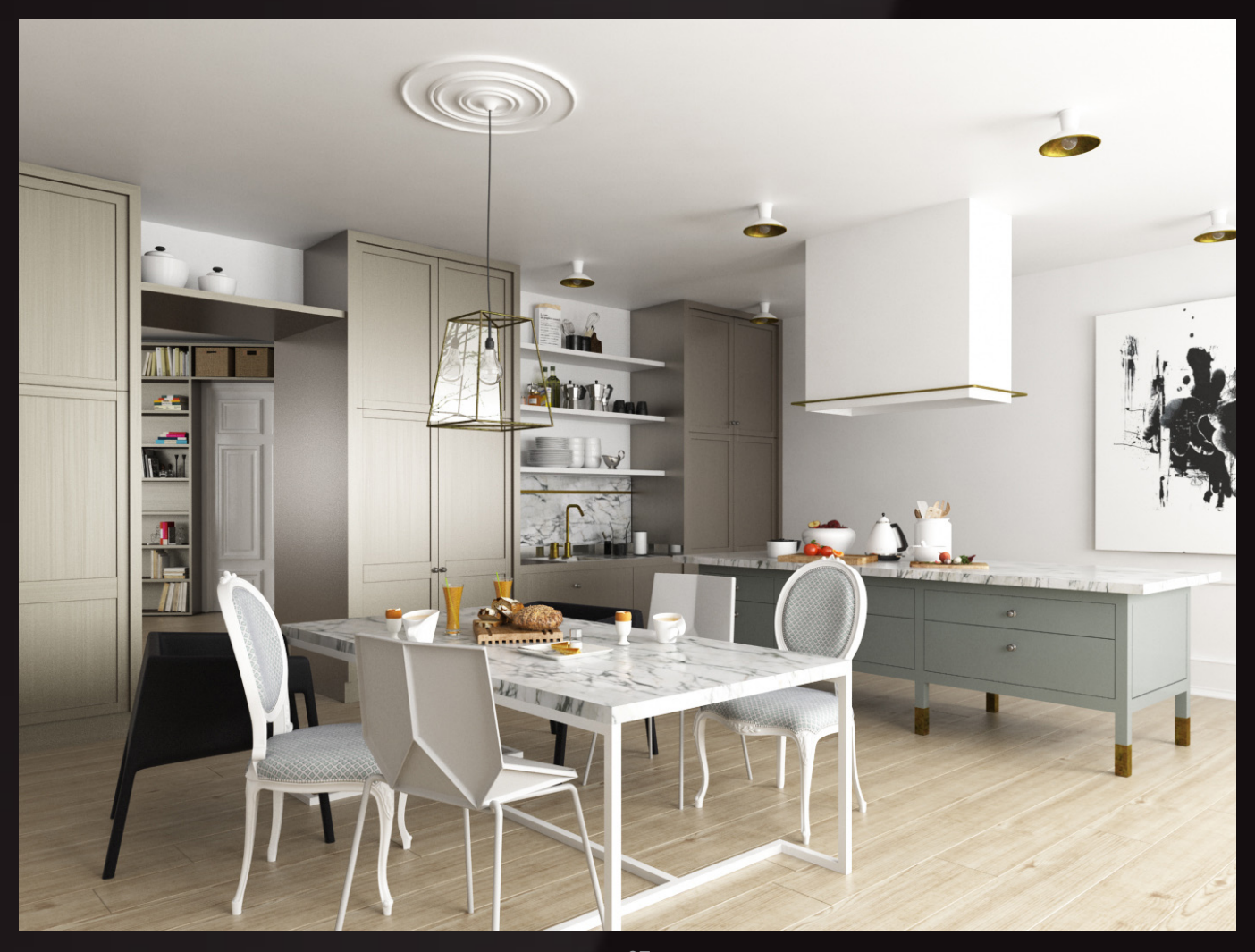
scene 07 raw

Have you ever wanted to make professional interior renderings? Do you know how to use VRaySun, VRaySky and VRayPhisicalCamera? Have you ever had problems with composition? Archinteriors will end all your problems. Take a look at this 10 fully textured scenes with professional shaders and lighting ready to render. Get your own portfolio and join cg market.