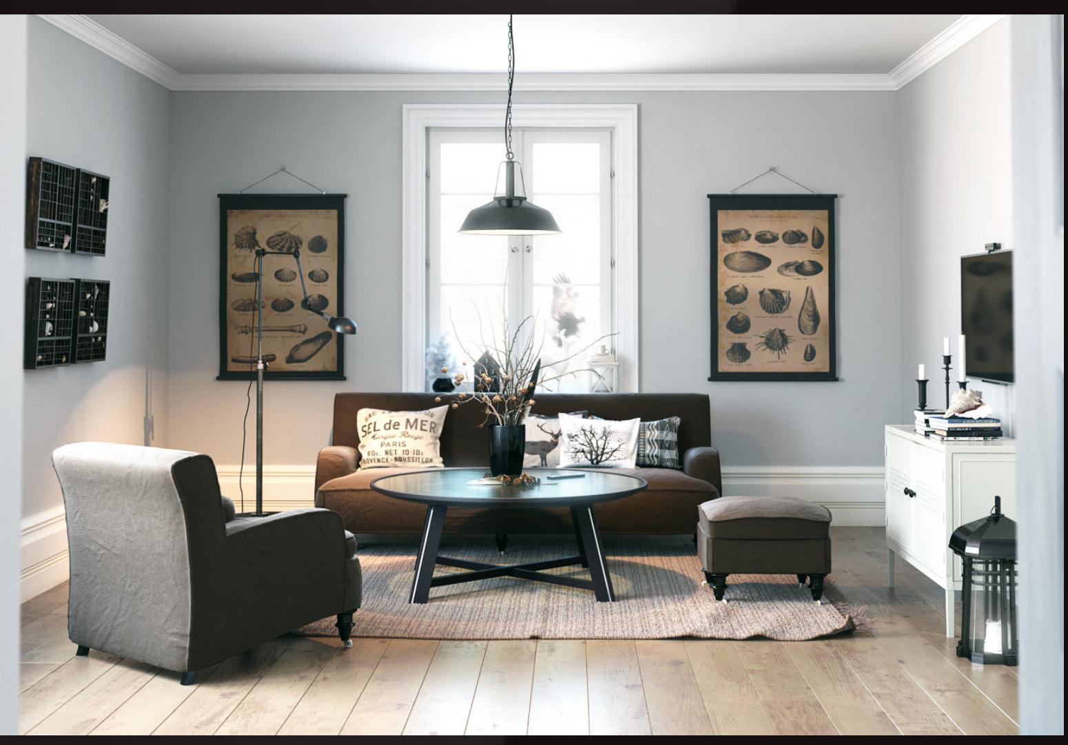
scene 08 post production

Have you ever wanted to make professional interior renderings? Do you know how to use VRaySun, VRaySky and VRayPhisicalCamera? Have you ever had problems with composition? Archinteriors will end all your problems. Take a look at this 10 fully textured scenes with professional shaders and lighting ready to render. Get your own portfolio and join cg market.