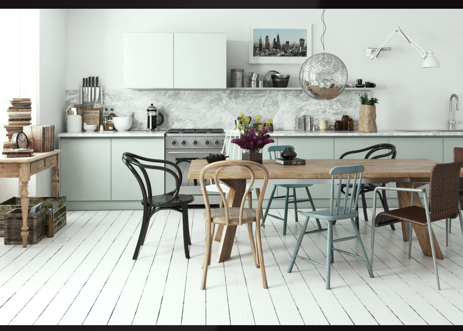
scene 01 post production

Have you ever wanted to make professional interior renderings? Do you know how to use VRaySun, VRaySky and VRayPhisicalCamera? Have you ever had problems with composition? Archinteriors will end all your problems. Take a look at this 10 fully textured scenes with professional shaders and lighting ready to render. Get your own portfolio and join cg market.