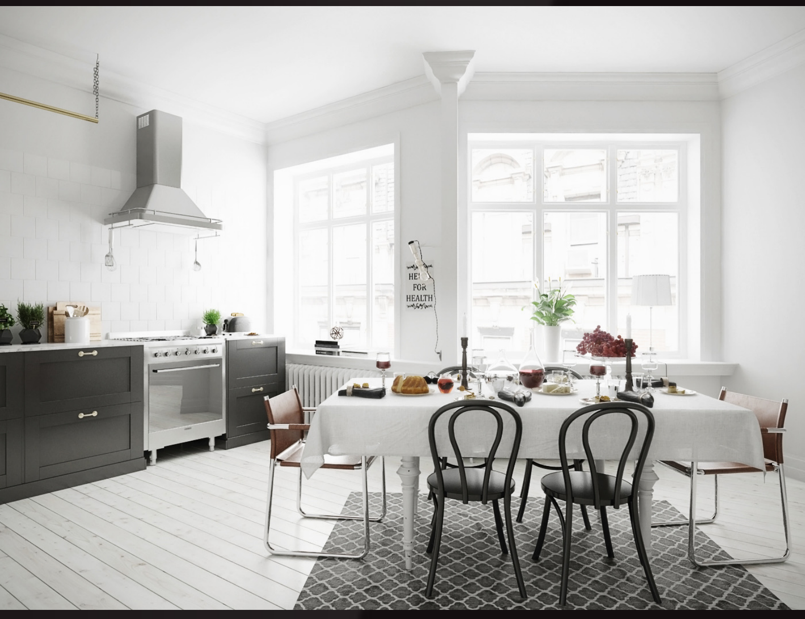
scene 02 post production

Have you ever wanted to make professional interior renderings? Do you know how to use VRaySun, VRaySky and VRayPhisicalCamera? Have you ever had problems with composition? Archinteriors will end all your problems. Take a look at this 10 fully textured scenes with professional shaders and lighting ready to render. Get your own portfolio and join cg market.