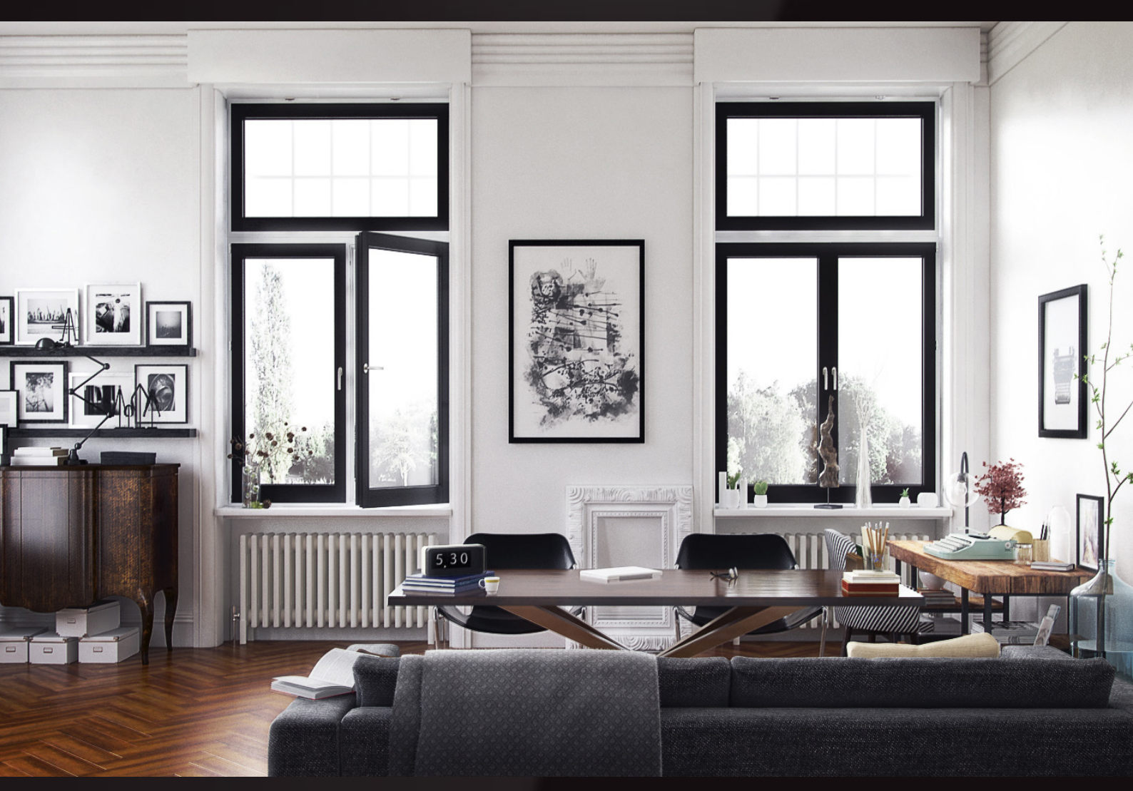
scene 09 post production

Have you ever wanted to make professional interior renderings? Do you know how to use VRaySun, VRaySky and VRayPhisicalCamera? Have you ever had problems with composition? Archinteriors will end all your problems. Take a look at this 10 fully textured scenes with professional shaders and lighting ready to render. Get your own portfolio and join cg market.