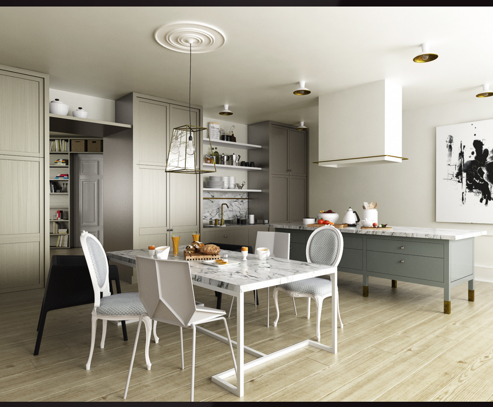
scene 07 post production

Have you ever wanted to make professional interior renderings? Do you know how to use VRaySun, VRaySky and VRayPhisicalCamera? Have you ever had problems with composition? Archinteriors will end all your problems. Take a look at this 10 fully textured scenes with professional shaders and lighting ready to render. Get your own portfolio and join cg market.