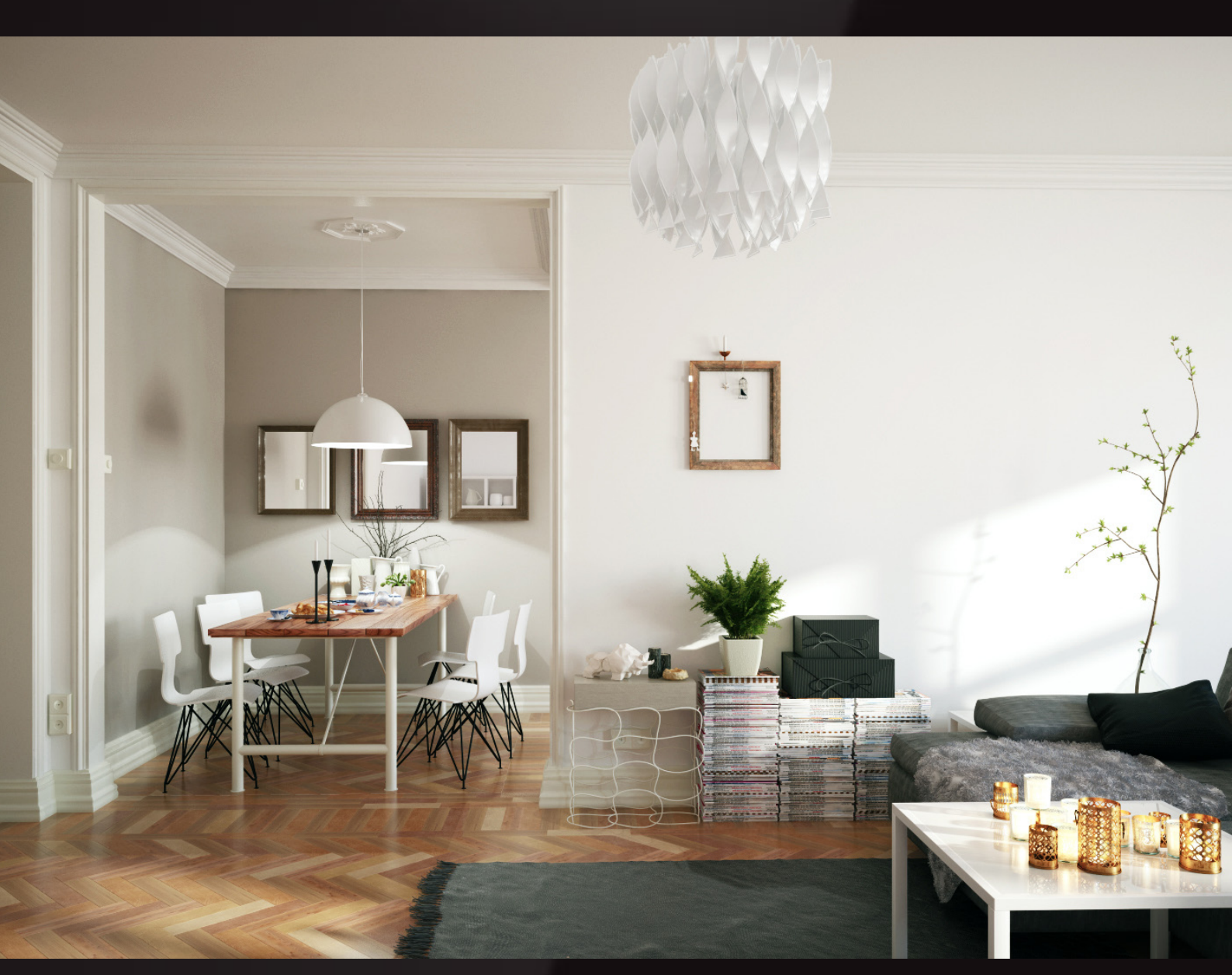
scene 10 post production

Have you ever wanted to make professional interior renderings? Do you know how to use VRaySun, VRaySky and VRayPhisicalCamera? Have you ever had problems with composition? Archinteriors will end all your problems. Take a look at this 10 fully textured scenes with professional shaders and lighting ready to render. Get your own portfolio and join cg market.