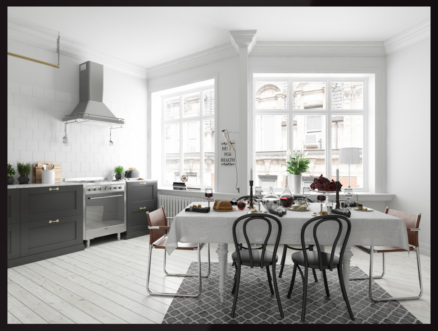
scene 02 raw

Have you ever wanted to make professional interior renderings? Do you know how to use VRaySun, VRaySky and VRayPhisicalCamera? Have you ever had problems with composition? Archinteriors will end all your problems. Take a look at this 10 fully textured scenes with professional shaders and lighting ready to render. Get your own portfolio and join cg market.