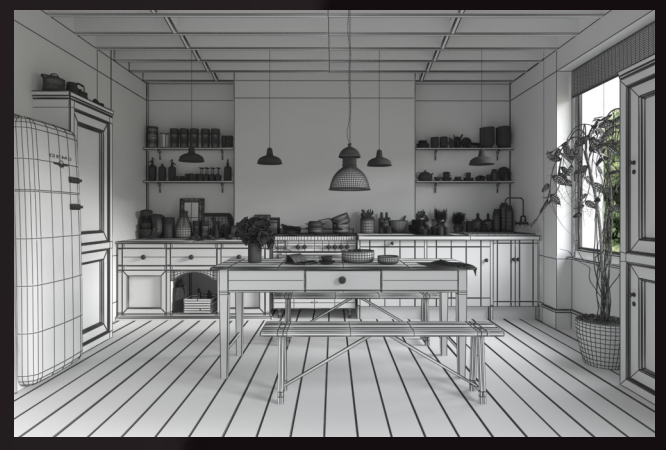
scene 03 wire