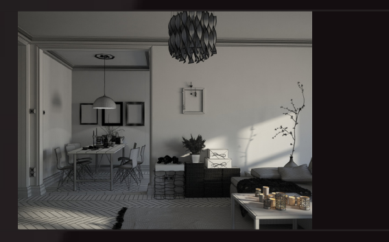
scene 10 wire