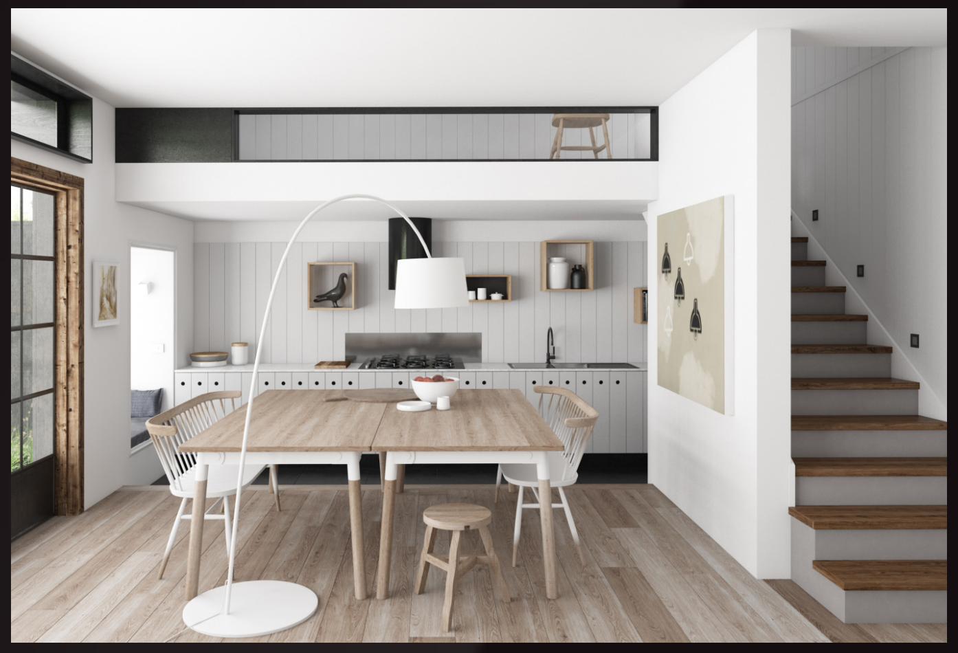
scene 05 raw

Have you ever wanted to make professional interior renderings? Do you know how to use VRaySun, VRaySky and VRayPhisicalCamera? Have you ever had problems with composition? Archinteriors will end all your problems. Take a look at this 10 fully textured scenes with professional shaders and lighting ready to render. Get your own portfolio and join cg market.