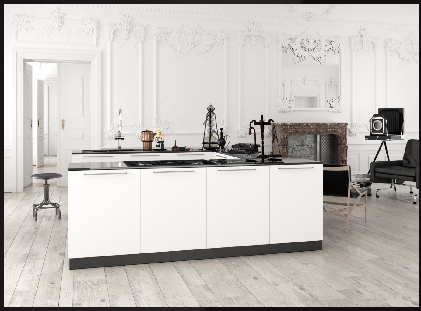
scene 04 raw

Have you ever wanted to make professional interior renderings? Do you know how to use VRaySun, VRaySky and VRayPhisicalCamera? Have you ever had problems with composition? Archinteriors will end all your problems. Take a look at this 10 fully textured scenes with professional shaders and lighting ready to render. Get your own portfolio and join cg market.