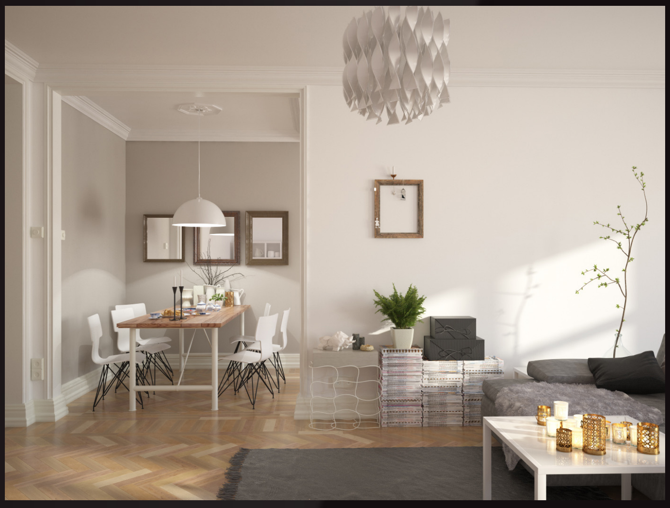
scene 10 raw

Have you ever wanted to make professional interior renderings? Do you know how to use VRaySun, VRaySky and VRayPhisicalCamera? Have you ever had problems with composition? Archinteriors will end all your problems. Take a look at this 10 fully textured scenes with professional shaders and lighting ready to render. Get your own portfolio and join cg market.