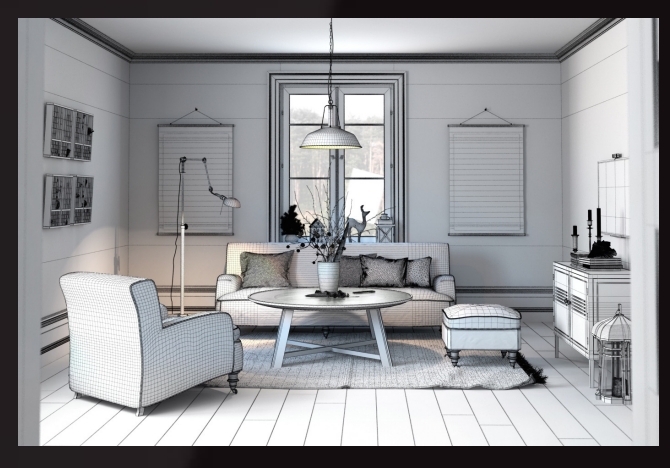
scene 08 wire