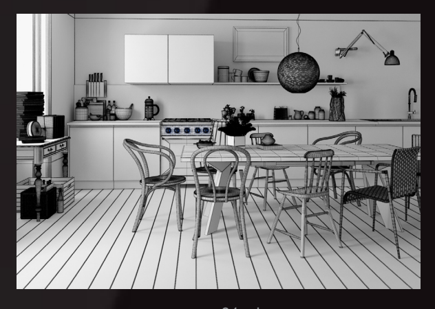
scene 01 wire