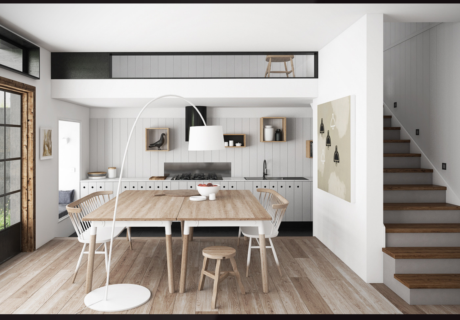
scene 05 post production

Have you ever wanted to make professional interior renderings? Do you know how to use VRaySun, VRaySky and VRayPhisicalCamera? Have you ever had problems with composition? Archinteriors will end all your problems. Take a look at this 10 fully textured scenes with professional shaders and lighting ready to render. Get your own portfolio and join cg market.