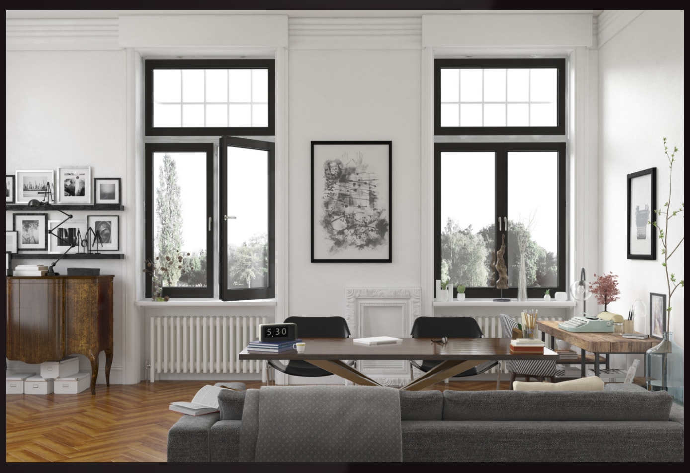
scene 09 raw

Have you ever wanted to make professional interior renderings? Do you know how to use VRaySun, VRaySky and VRayPhisicalCamera? Have you ever had problems with composition? Archinteriors will end all your problems. Take a look at this 10 fully textured scenes with professional shaders and lighting ready to render. Get your own portfolio and join cg market.