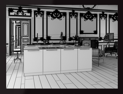
scene 04 wire