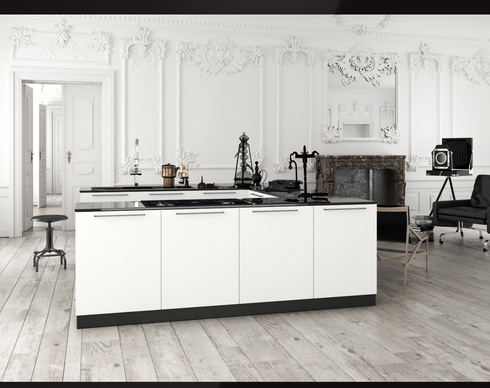
scene 04 post production

Have you ever wanted to make professional interior renderings? Do you know how to use VRaySun, VRaySky and VRayPhisicalCamera? Have you ever had problems with composition? Archinteriors will end all your problems. Take a look at this 10 fully textured scenes with professional shaders and lighting ready to render. Get your own portfolio and join cg market.