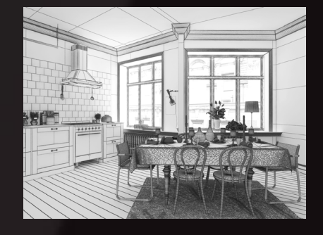
scene 02 wire