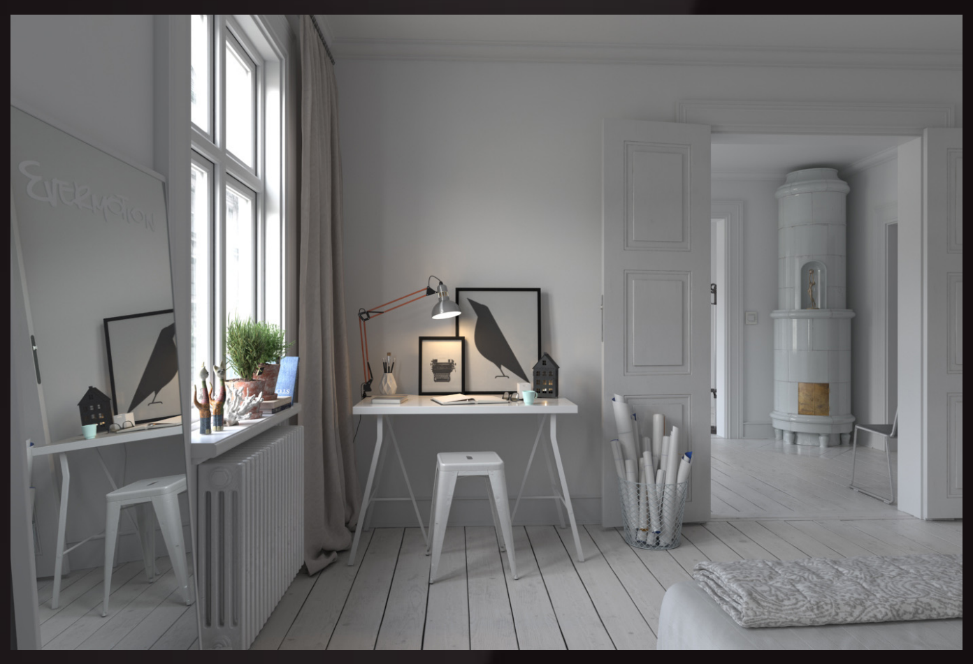
scene 06 raw

Have you ever wanted to make professional interior renderings? Do you know how to use VRaySun, VRaySky and VRayPhisicalCamera? Have you ever had problems with composition? Archinteriors will end all your problems. Take a look at this 10 fully textured scenes with professional shaders and lighting ready to render. Get your own portfolio and join cg market.